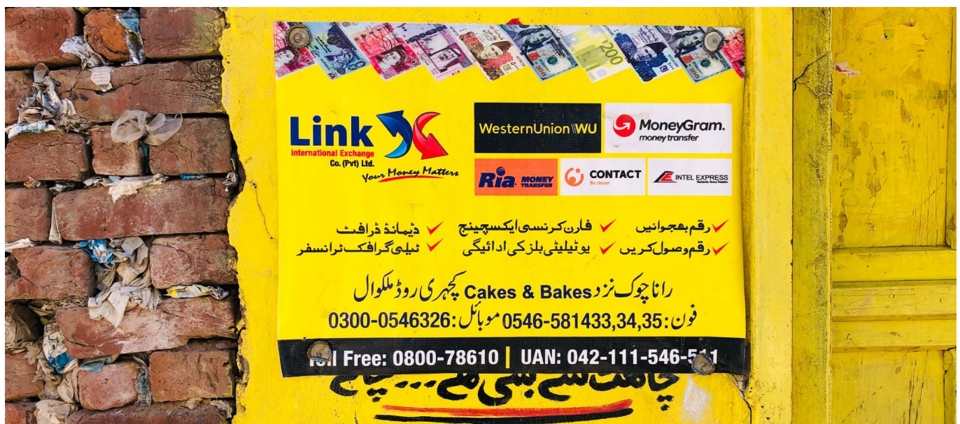
A remittance poster in Chot Dheeran, Pakistan, where international migration supports local development, yet the effects often reinforce socio-economic disparities.