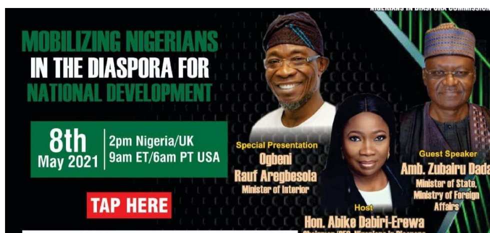
Figure 2: Advertisement for a quarterly lecture organised by NiDCOM

The policy lays out the institutional framework, specific objectives and a plan of action along nine key priorities: i) coordination of diaspora activities; ii) developing the culture and tourism sectors, iii) facilitate political inclusion and participation of the diaspora, iv) engage the diaspora in the delivery of health services (e.g., customs duty waived for health equipment), v) cooperate with the diaspora in educational development, vi) promote significant investment in the economy by the diaspora (e.g., through public-private partnerships, creating incentives for investment), vii) facilitate cost-effective remittances, viii) enhance the contribution of organised labour migration (e.g., portability of benefits), and ix) engage the diaspora to develop science, technology and innovation for the industrial and technological development of the country.